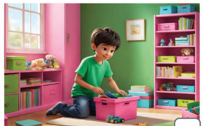
Tidying your room