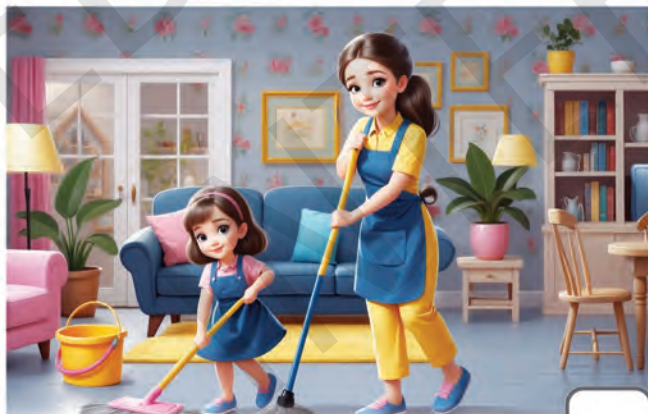
Cleaning the house