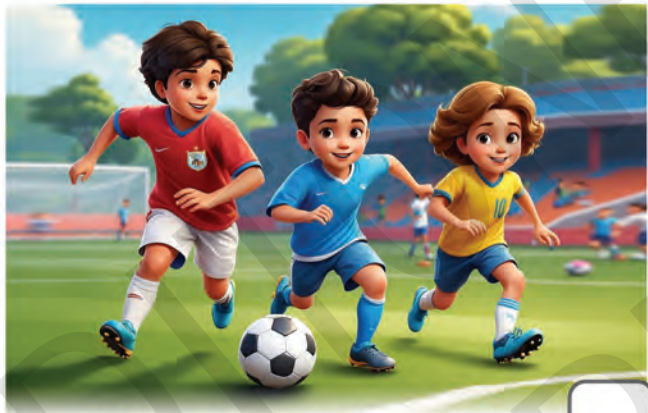
Playing with sibling