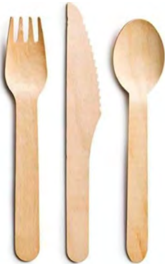
Fork | Knife | Spoon